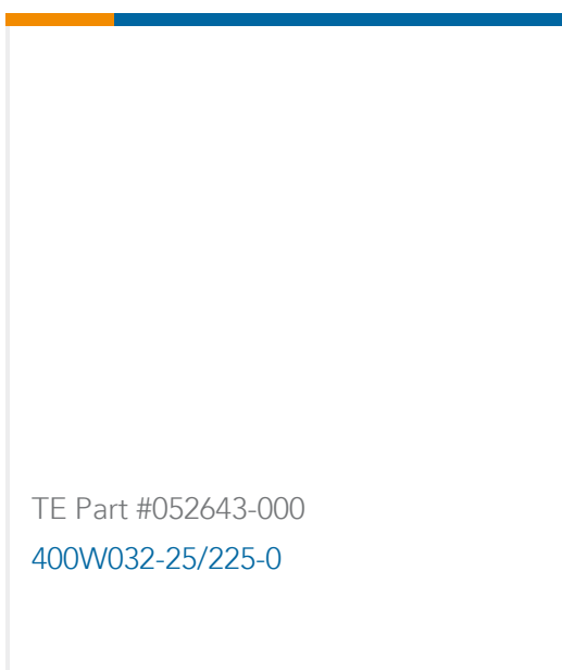
TE Part #052643-000 400W032-25/225-0