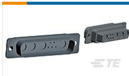
TE Part #5-212498-1 PLUG ASSY,9C4,AMPLIMITE