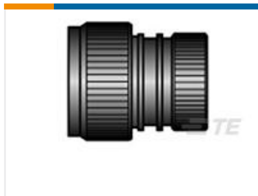
TE Part #223649-000 HEX40-AB-00-23-A10-2-DS