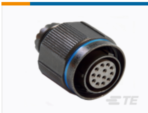
TE Part #YACT26JJ35SN000000 STRAIGHT PLUG