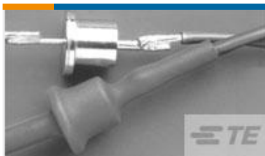
TE Part #5677904002 RNF-3000-1.5/0.5-X-SP