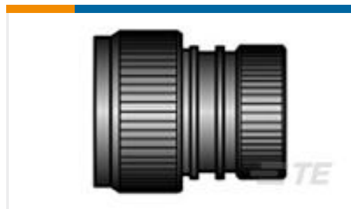
TE Part #141053-000 HEX40-AB-00-15-A5-2-DS